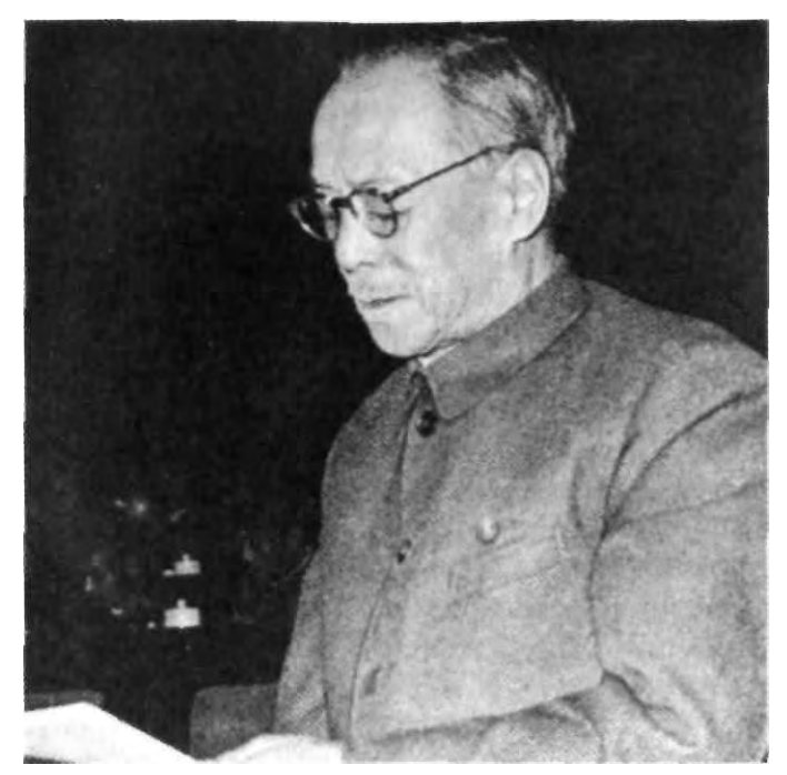
K'ang Sheng, Communist China's spymaster.

he came to the attention of party leaders by demonstrating a flair for espionage. He organized an informal spying operation to ferret out police spies from the party, an operation he extended to include spying on "dissidents" in the party who failed to demonstrate sufficient zeal in toeing the latest party line.