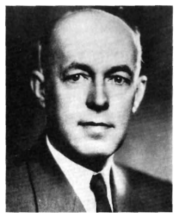
Herbert Yardley, the legendary American codebreaker whose Black Chamber was to dramatically affect the course of World War II in the Pacific.

in use, the more he was convinced that they were so simple as to make them useless for modern coded communications. Rebuffed by his superiors when he complained about the codes, Yardley decided on direct action to make his point: over a period of several months, he solved every single American code then in existence, and wrote up a report entitled Exposition on the Solution of American Diplomatic Codes. He concluded that European nations, known to have a first-class cryptographic ability, undoubtedly were reading the simple American codes with ease. He impolitically presented this report to his superior, who just happened to be the man who devised the codes in the first place. To further make his point, Yardley coolly walked into the man's office and opened his safe—whose combination, Yardley figured out, was based on the telephone number of President Woodrow Wilson's fiancee.