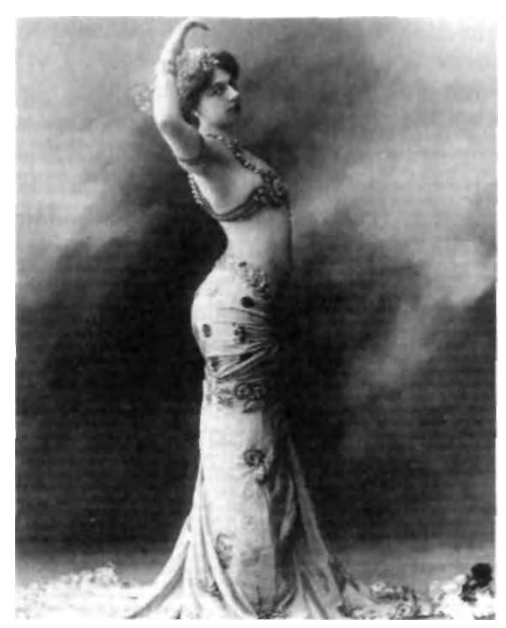
Margareta Zelle, in costume as the "Eye of Dawn" (Mata Hari).

spy; she remains the one instantly recognizable name in the public's mind when the subject turns to spies.