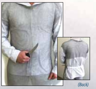
85B – Bolero Vest

Short Vest, 12" front & back with double mesh sleeves